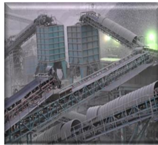
Crushing and screening design and planning