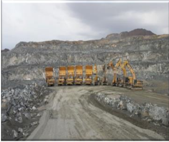
Quarry Consultancy services

While transport and logistics remain the foundation of our business, our group has additional interests in: